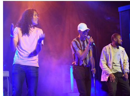
Music Events & Concerts