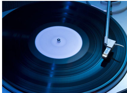
Upcoming Music Releases & Media